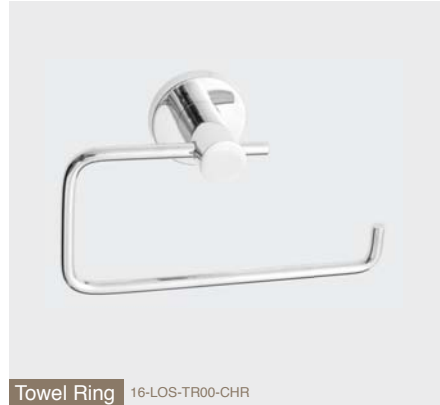
Towel Ring 16-LOS-TR00-CHR