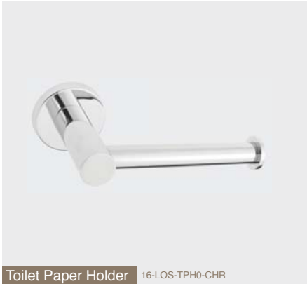
Toilet Paper Holder 16-LOS-TPH0-CHR