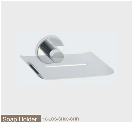
Soap Holder 16-LOS-SH00-CHR