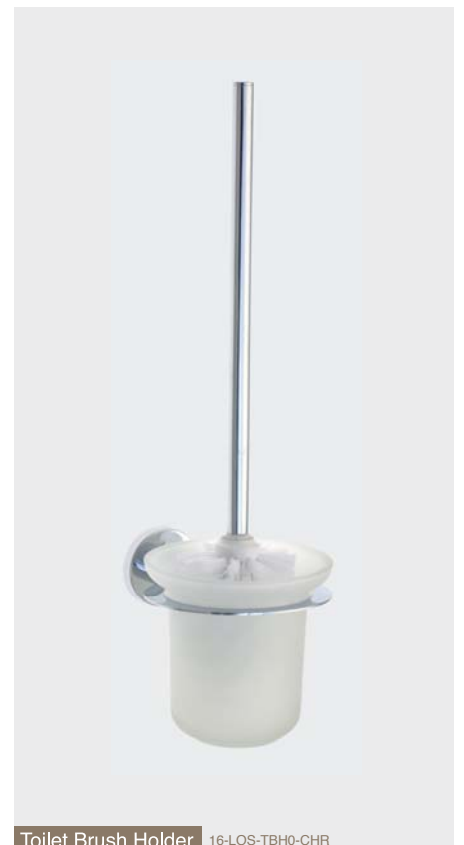
Toilet Brush Holder 16-LOS-TBH0-CHR