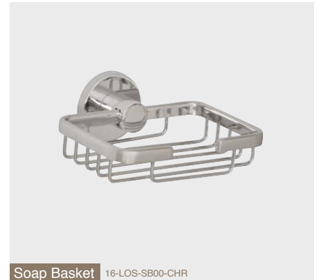
Soap Basket 16-LOS-SB00-CHR