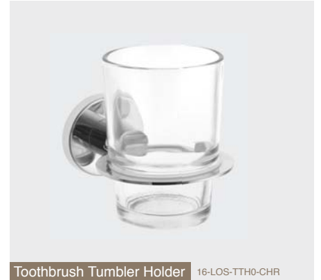
Toothbrush Tumbler Holder 16-LOS-TTH0-CHR