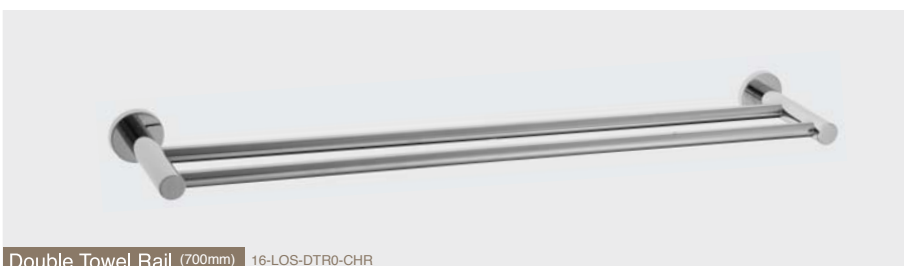
Double Towel Rail (700mm) 16-LOS-DTR0-CHR