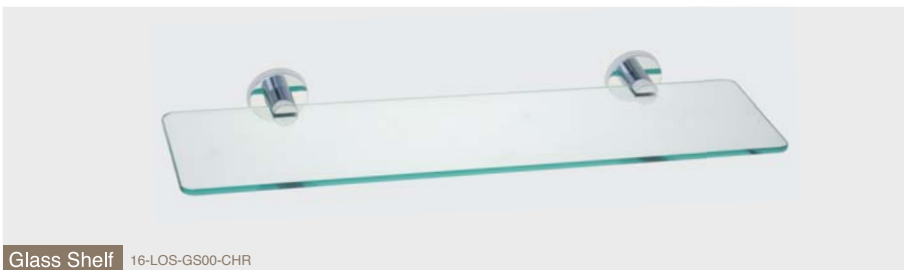
Glass Shelf 16-LOS-GS00-CHR