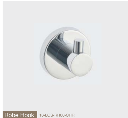
Robe Hook 16-LOS-RH00-CHR