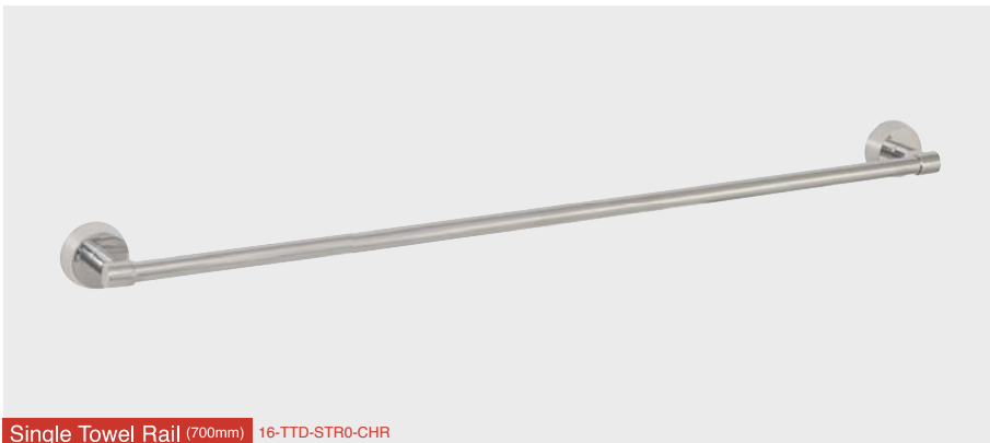
Single Towel Rail (700mm) 16-TTD-STR0-CHR