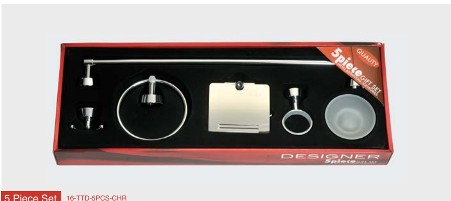
5 Piece Set 16-TTD-5PCS-CHR