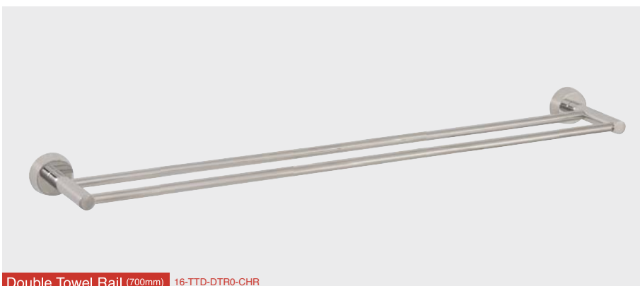
Double Towel Rail (700mm) 16-TTD-DTR0-CHR