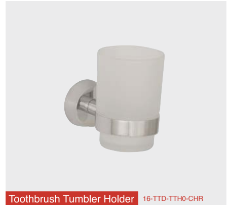
Toothbrush Tumbler Holder 16-TTD-TTH0-CHR