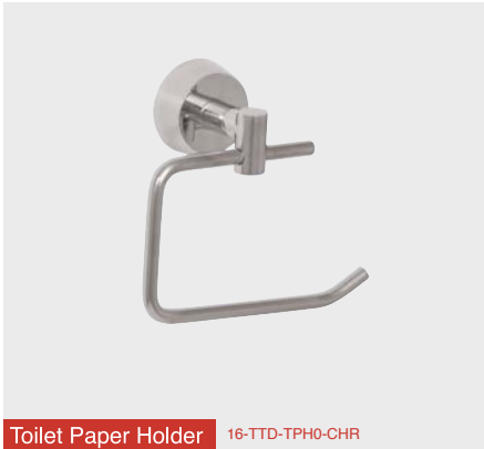
Toilet Paper Holder 16-TTD-TPH0-CHR