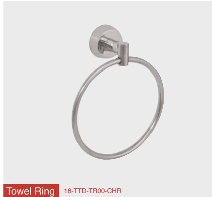
Towel Ring 16-TTD-TR00-CHR